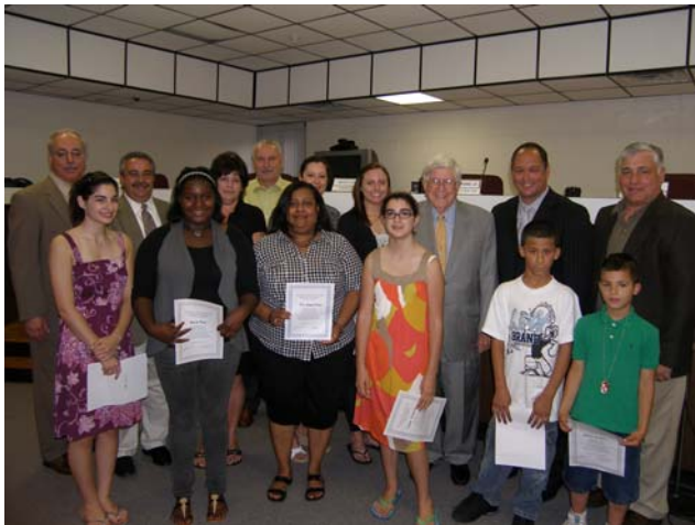
Caption for "No Phone Zone 01.jpg":