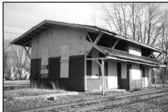
The West Jersey Station today.

DPK & A is in the process of collecting the history surrounding the West Jersey Depot site as well as several other rail lines that ran through Glassboro. The design phase will continue for the next several months and when it is complete, the